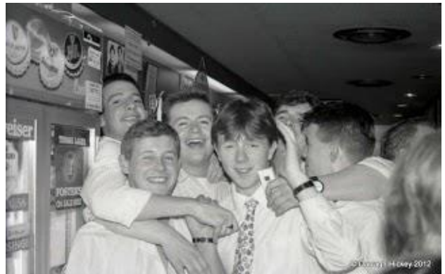
Outside the restaurant 1991

To find out more about events and communications organised by the UCD Alumni Relations Department go to www.ucd.ie/alumni