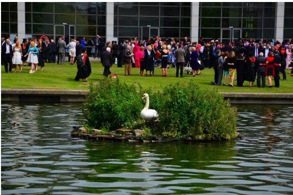
Swan in the lake at O'Reilly Hall